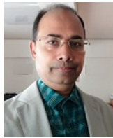
RI Maruf Session MC (Kyushu Univ)