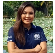
TS Carraway (AIT, Thailand)